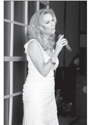
Member Kathie Lee Gifford opened the event with a performance of her song "Everyone Has a Story," which inspired the event's "Every Charity Has a Story" theme.