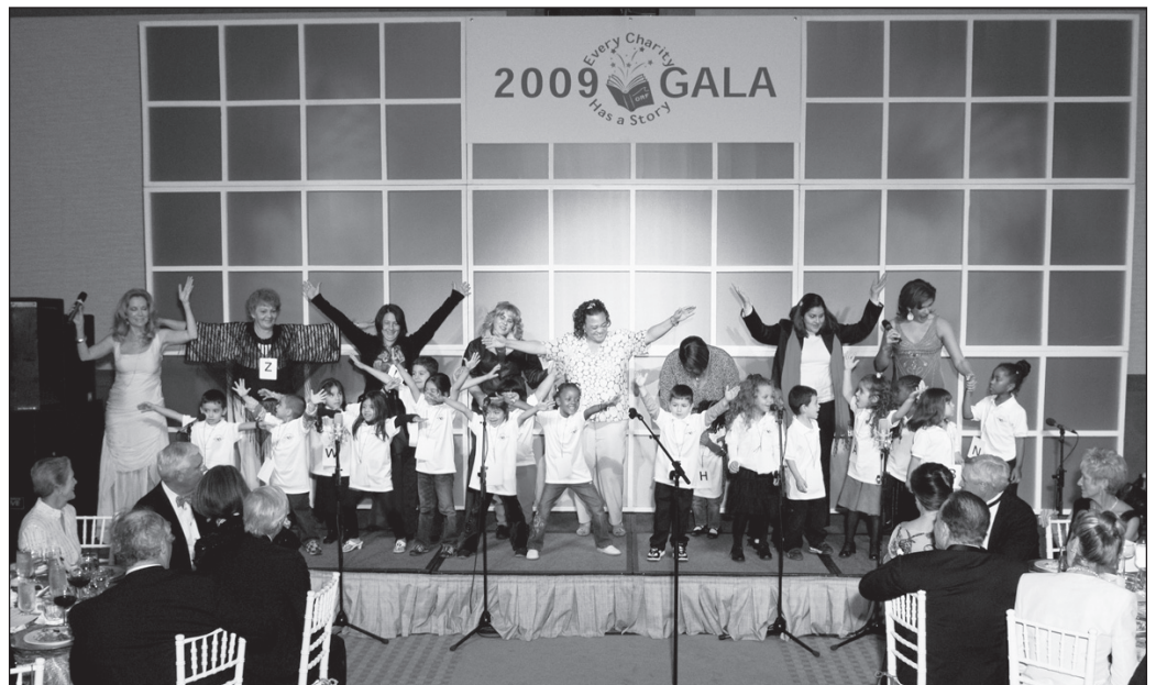
25 Children from the Association for Retarded Citizens' Project Thrive, a beneficiary of auction, sing a special song of thanks to Ocean Reef.